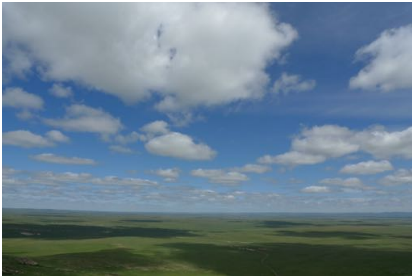
East Ujimqin China-Mongolia borderland, Inner Mongolia Autonomous Region.