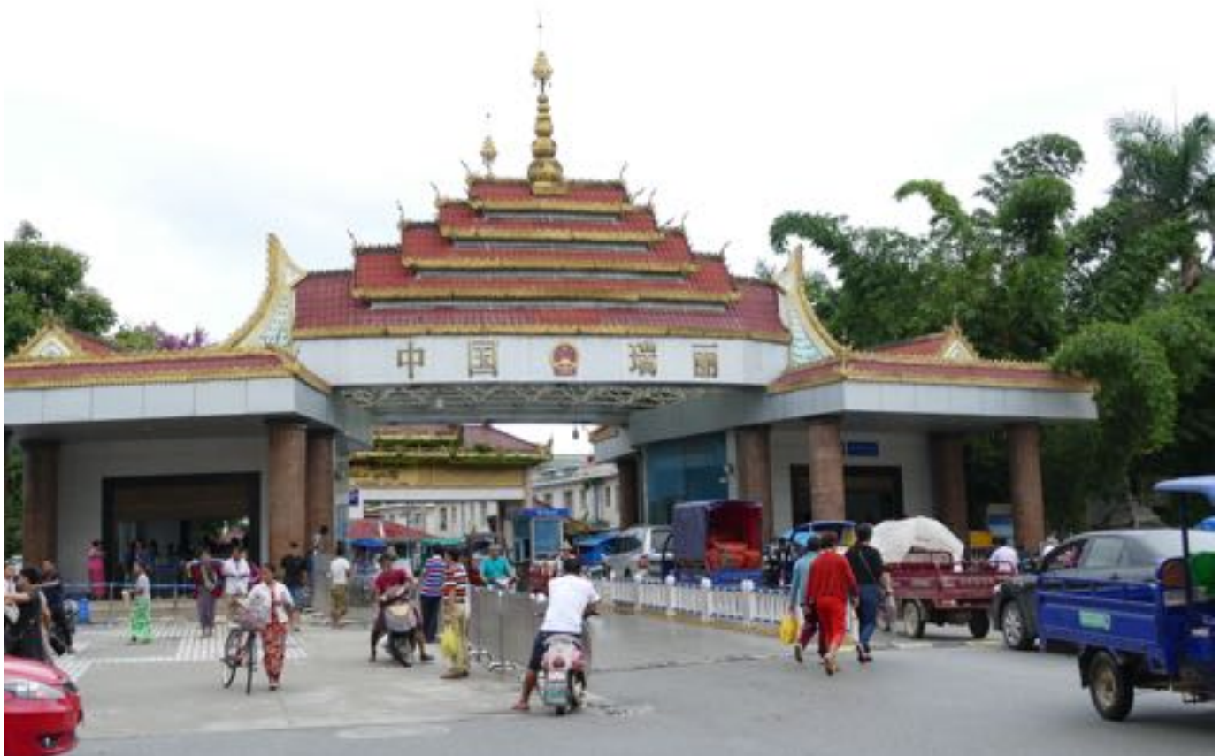
Chinese border checkpoint in Ruili, Yunnan Province.